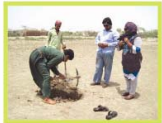
Construction of the Citi Bank BHU begins in Sujawal