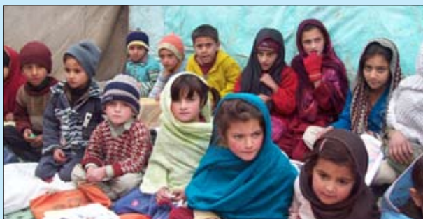
The Northern Area Barclays Home School