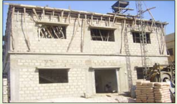
Formal School in Thatta - Nearing Completion