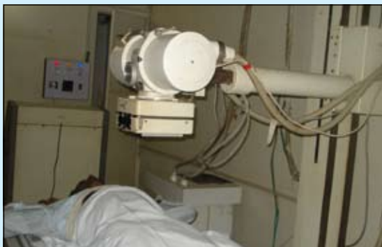
X Ray machine donated by USA HOPE at HOPE Hospital, Zia Colony.