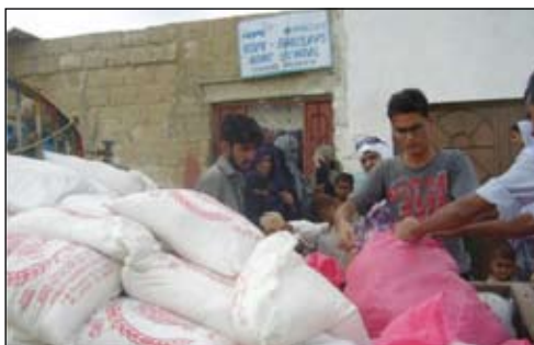
Ration Distribution in Ramzan