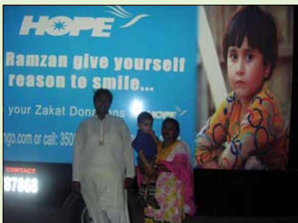
The HOPE VAN for Ramzan Campaign