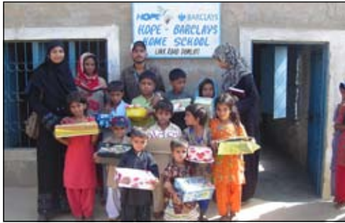
Eid Gifts Distribution for HOPE Home School Children